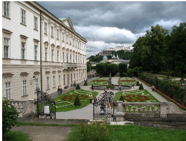
Mirabel Gardens , Salzburg (where The Sound of Music was filmed)